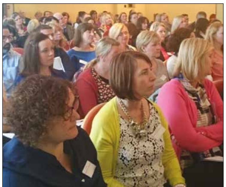
Attendees at the Learning Disability and Dementia Master Class event held on 20 October 2016