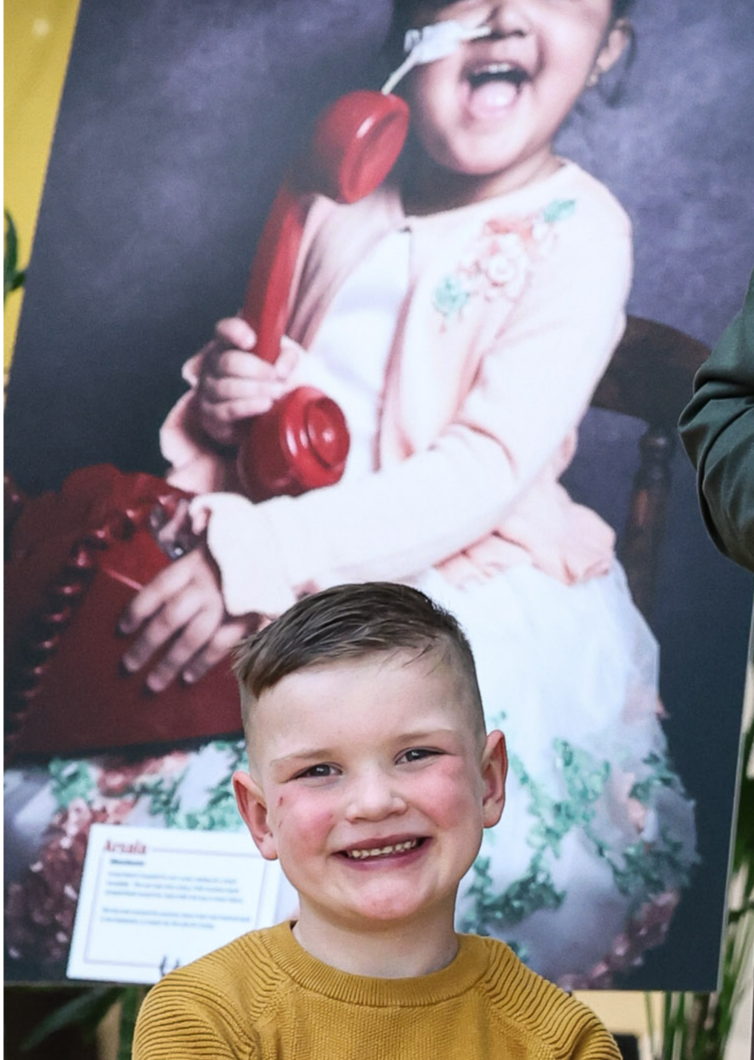
Arzala Museum This photograph was taken in 1968, when the girl was 10 years old. She was the first child to be born with a cleft lip and palate. The photograph was taken by a friend of the family, and it is a very rare and valuable record of the child's life. The girl was born with a cleft lip and palate, and she was the first child to be born with this condition. The photograph was taken in 1968, and it is a very rare and valuable record of the child's life.