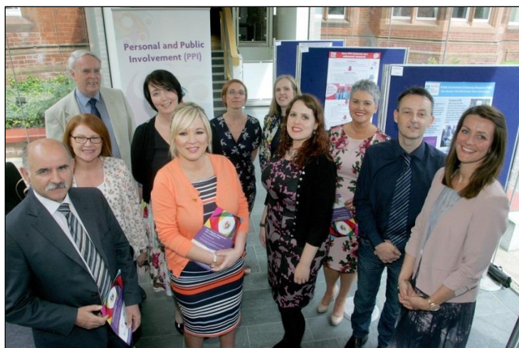
Members of the HSC Regional Forum with the Minister of Health, Michelle O'Neill at the Involving you, improving care: our involvement story conference, June 2016.