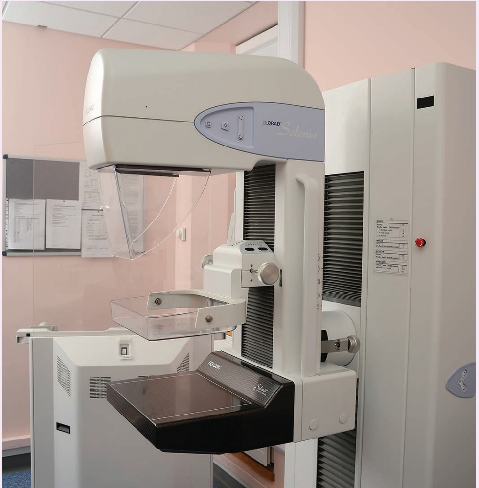
Digital mammogram machine