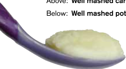
Below: Well mashed potato