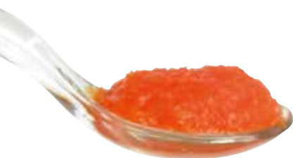
Above: Well mashed carrot