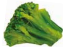
Above: A floret of cooked broccoli Below: Stewed apple