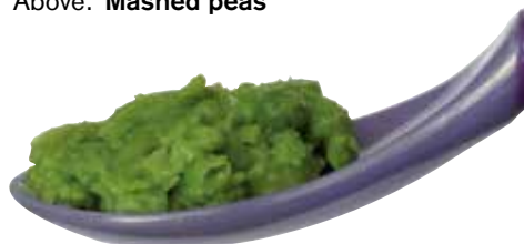
Above: Mashed peas