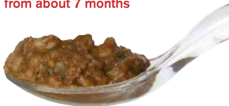
Above: Minced beef