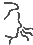
Loss of, or change in, sense of taste or smell