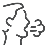
New continuous cough