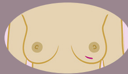
Skin changes like dimpling