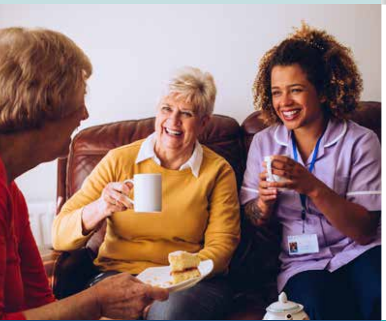
Ask your doctor, nurse or healthcare professional about research.