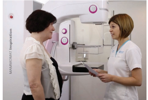
Digital mammogram machine

The whole appointment takes less than half an hour and the mammogram only takes a few minutes.